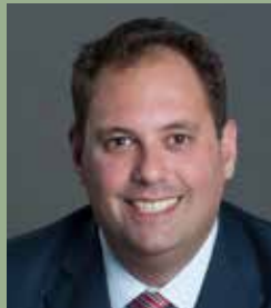
The Hon. Philip Dalidakis MP Minister for Small Business, Innovation and Trade