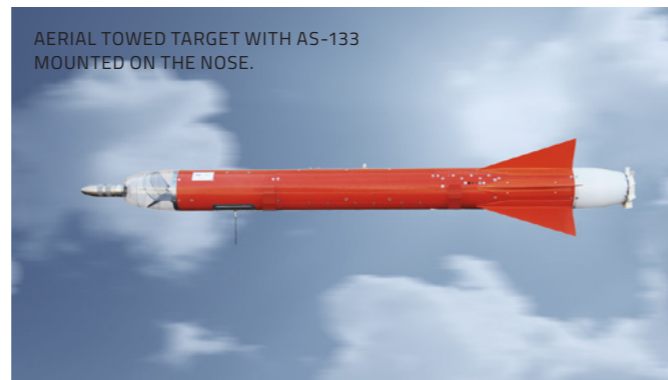
AERIAL TOWED TARGET WITH AS-133 MOUNTED ON THE NOSE.