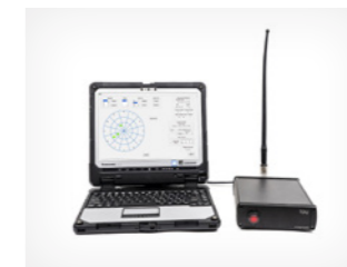
SCORING STATION TOR The TOR scoring station is a computerized scoring station for collection, calculation and presentation of real time firing results from the universal 12-sector miss distance indicators.