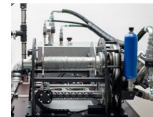
TARGET TOWING WINCH The MBV 45 electro/hydraulic operated winch is intended for medium duty target towing operations with inboard installation in the towing aircraft.