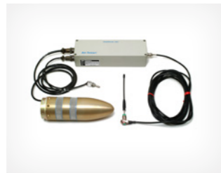
AS-133 AS-133 is intended to be installed in the nose of UAVs or hard targets.