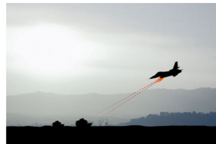
AIR-TO-GROUND Improving the pilot's precision skills with every exercise.