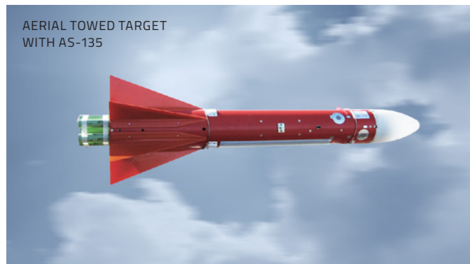
AERIAL TOWED TARGET WITH AS-135