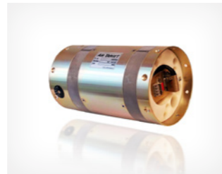
AS-134 AS-134 is designed to be installed in target drones, UAVs or hard targets.