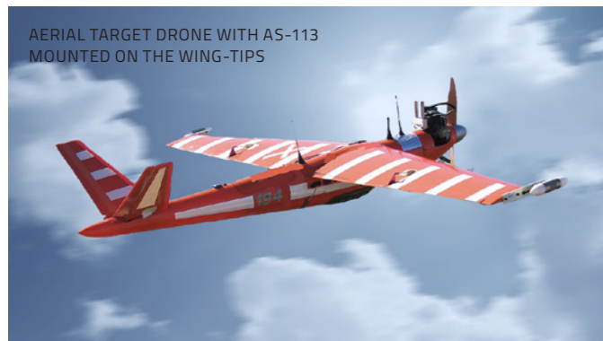
AERIAL TARGET DRONE WITH AS-113 MOUNTED ON THE WING-TIPS