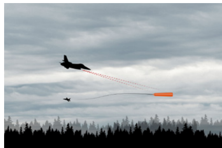
AIR-TO-AIR Realistic training scenarios with universal angle sensors.