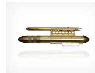
AS-131 The AS-131 for sleeve targets is a universal 12-sector miss distance indicator (MDI).

be equipped with GPS, flashing lights and onboard scoring data logging function. The sleeve target is available in different lengths, colors, with or without radar and/or laser reflecting function in order to simulate the right target signature. The target towing winch, which can be internally or externally fitted to the aircraft, deploys the target in the mission area and recovers the target after the mission. The deployed length of the wire is normally between 800-11 000 meters.