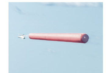
SLEEVE TARGET The sleeve target has a slight conical shape. It is manufactured of PVC coated fabric. It consists of a circular half spheric end, and two longitudinal orange colored gores.