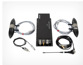
AS-113 AS-113 is intended to be installed on the wing-tip or on the body of UAVs or hard aerial targets.

becomes available within in a very short period of time. Air Target Sweden provides different MDI platforms for integration into any kind of towed or remotely piloted aerial target. All Air Target MDI is available as universal type, i.e. they handle all target courses relative the firing gun or missile, i.e. all types of attacking and passing courses with real-time presentation of the live-firing results to the user.