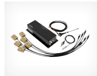
AS-135 The AS-135 is designed to be installed in the hull of target drones or hard targets.