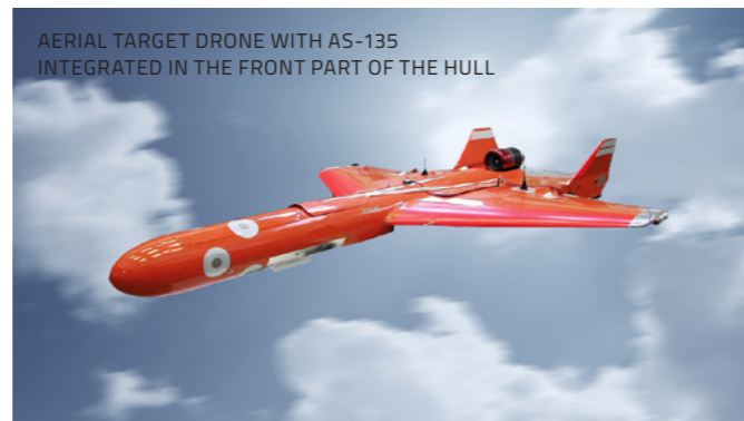
AERIAL TARGET DRONE WITH AS-135 INTEGRATED IN THE FRONT PART OF THE HULL